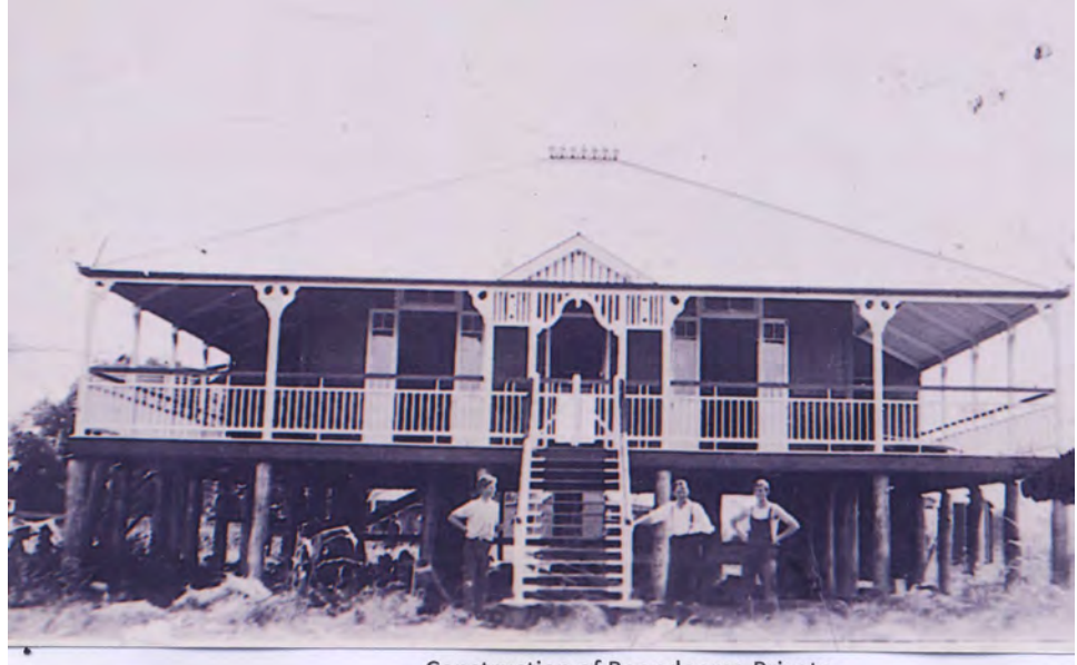
Construction of Boondooma Private Hospital - 1935

The hospital operated until 1940. After its closure the building became the Margaret Marr Boys Home during the war years. The verandahs were closed in and used as dormitories for the boys and underneath the building was also closed in and was used as a kitchen-dining room. Following the end of the war, the building became a boarding/guest house. It is now a private residence and is situated opposite the Anglican Church in Proston.