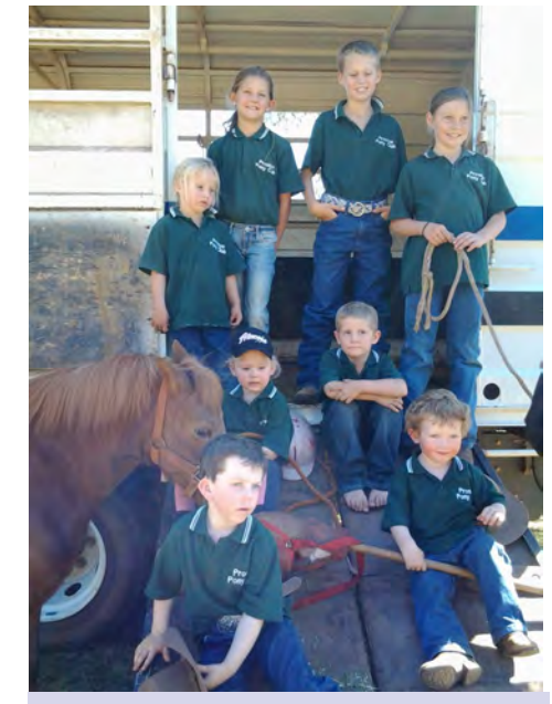
Our Pony Clubbers are looking a little tired at the end of a fun morning out with their ponies and friends.

Lions are also seeking used stamps to assist in purchasing walking aids for children born with cerebral palsy.