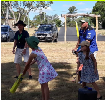
Some cricket action at the Proston Scouts.