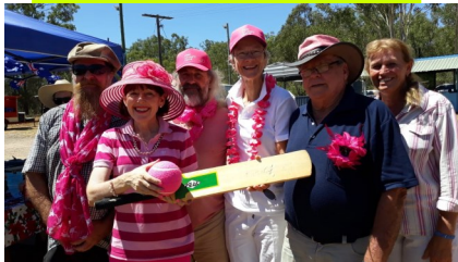
Pink Stumps Cricket Captains and award winners.