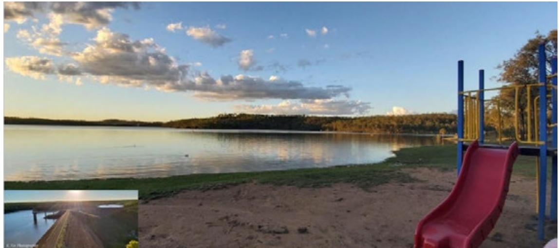
Many thanks to Kate Tallar for this stunning shot of Lake Boondooma taken from the picnic area on 3rd December 2021. Inset photo of the Dam wall.