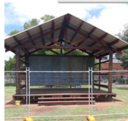
Exciting to see the outdoor stage in Railway park is nearing completion. It has been funded by an FRRR grant.

Craving Christmas Trifle?? Proston Heritage Assn will be selling individual Trifle serves at the Christmas Carnival on Saturday 18th December.