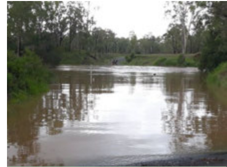
The Stuart River at Proston cut the Proston-Boondooma Road for some time. Photo taken on Wednesday 1st December 2021.

as well as supplying water for irrigators downstream, particularly around the fruit growing areas of Mundubbera. Visitors to the the Dam for the Christmas/New Year holidays can look forward to a great boating, fishing and camping experience. Rainfall recorded at the Proston Post Office was 275.2mm for November and 69mm to the 4th December.