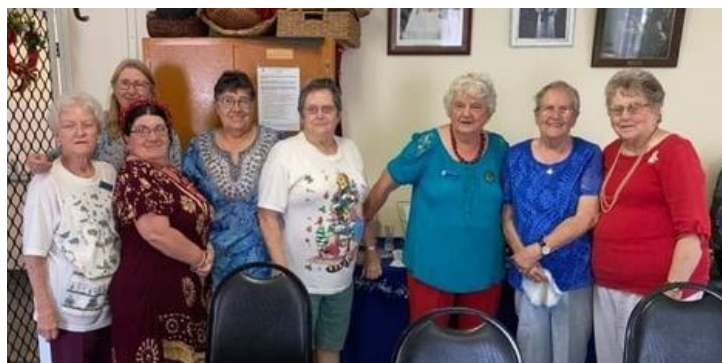
Proston QCWA Christmas Breakup, on Monday 6 th December 2021.

"Jingle" The Elf on the Shelf got up to mischief once again – this time he tried to cut down the Christmas Tree, and tipped the tea, coffee, and sugar packets out of the containers in the cupboard.