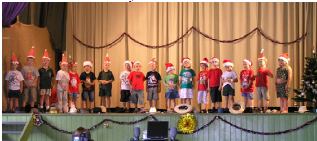
Proston State School Preschool class of 2005 on stage at the old Proston Hall for their Christmas Concert. These little cuties would all be turning 21 now.