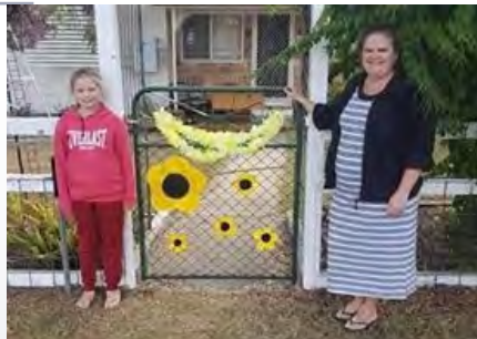
Some Proston residents got into the spirit of Ray of Sunshine South Burnett by decorating their fences in yellow.