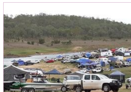
Lake Boondooma was a popular destination during the Christmas/New Year holidays. A large crowd enjoyed camping, boating, fishing and picnicking in the lovely bush setting beside the water.