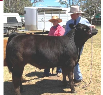
"Showtime" (above) and "Sapphire" (below).

2021 is shaping up to be an exciting year for the teachers and students of the Proston State School Agriculture Program.