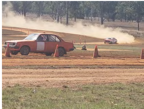
"Doing it in the dirt" at another successful Proston Car Rally weekend recently. The Rally attracted record entries.