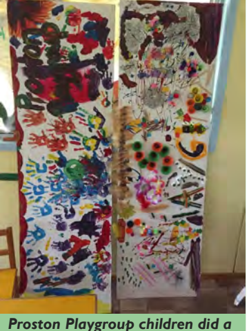
Proston Playgroup children did a great job of painting the sides of their boat for the Proston Regatta in the Park.

Following this, set sail for the Proston Regatta in the Park. This is fun for the whole family and follows on from a very successful inaugural event last year. Get your crew ship-shape and navigate your boat around a set course in the park to win some great prizes. Cost is $2.50 per event and everybody wins a prize in the lucky dip. Ever fancied being a Mermaid or a Pirate? Here's your chance with a prize for the best nautical themed costume on offer. Come join the fun!