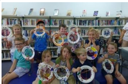
Some very industrious little crafters show off the "Creature Catchers" they made at the school holiday activity at the Library.

Save the Date: Proston Lions Community Christmas Carnival Sat 14th December