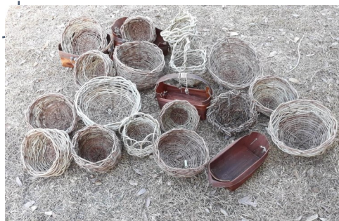
A happy group of weavers used cat's claw vine and piccabean to create these unique baskets at the Weaving with Natural Fibres workshop held recently. Thanks to Tracy Lewis for a fun and creative day.

Proston Heritage Assn are collating a book for the Centenary and are looking for anyone who would like to contribute their Proston story/memory. In 500 to 1000 words tell us about your memories of Proston and submit it as soon as possible. Please email your stories, along with any photos you would like to include to theprostonhc@gmail.com