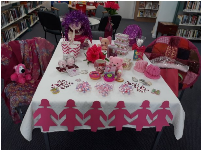
The lovely display in the Library for "Pinking up Proston."