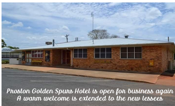
Proston Golden Spurs Hotel is open for business again A warm welcome is extended to the new lessees

Come and join in a walk of the Orange Circuit Track (approx. 2km) through Reinke Scrub Conservation Park. All meet at the parking area. Please remember to bring a hat, water bottle and closed in shoes for walking. All welcome!